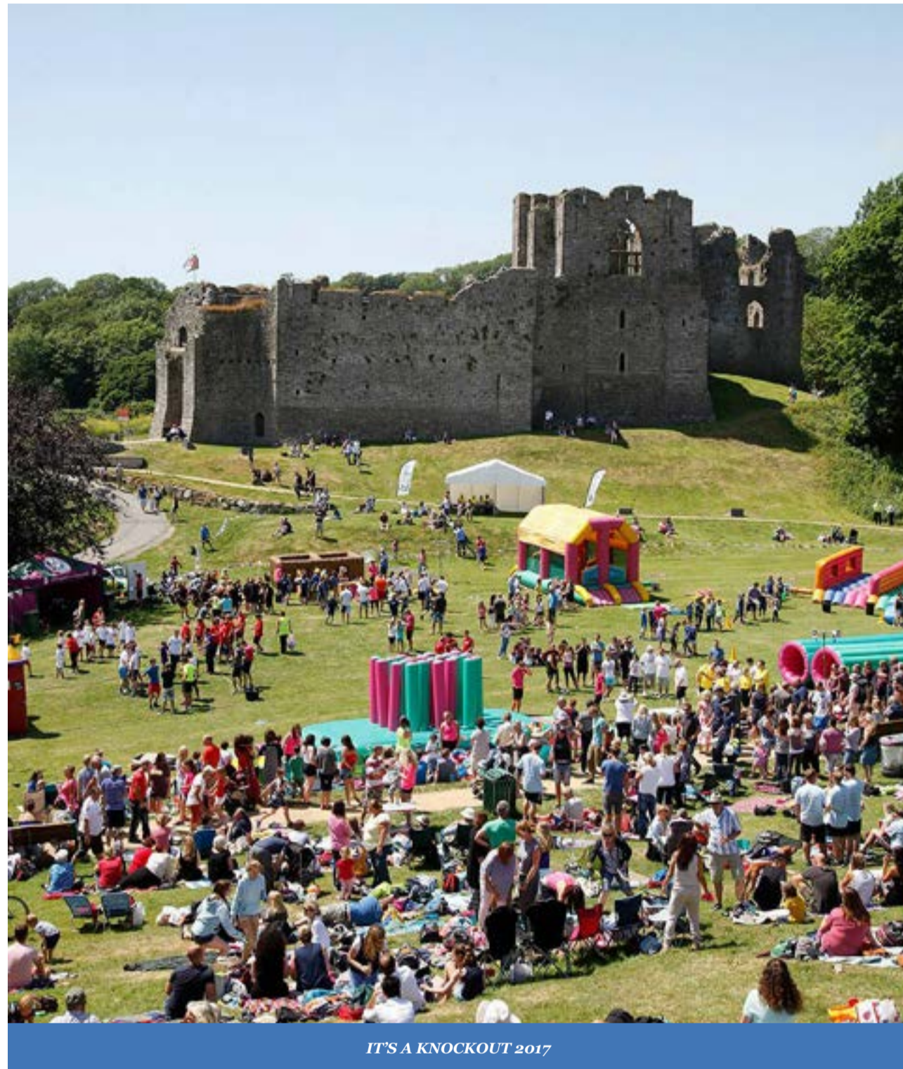
IT'S A KNOCKOUT 2017

Many other events put on by local community, voluntary and sports groups were supported by grants from MCC (see Grants to Local Organisations 2017-18 on page 11).