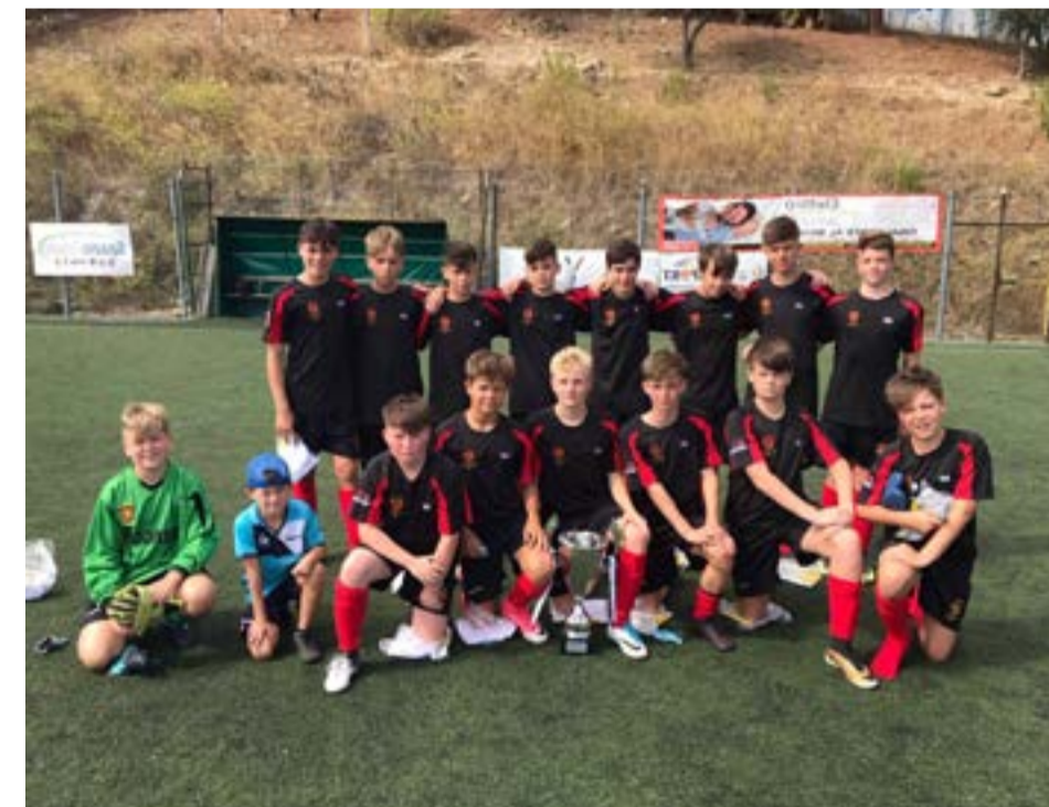
MCC CONTRIBUTED £500 TO MUMBLES RANGERS UNDER 14S TO COMPETE AT A FOOTBALL TOURNAMENT IN GENOA