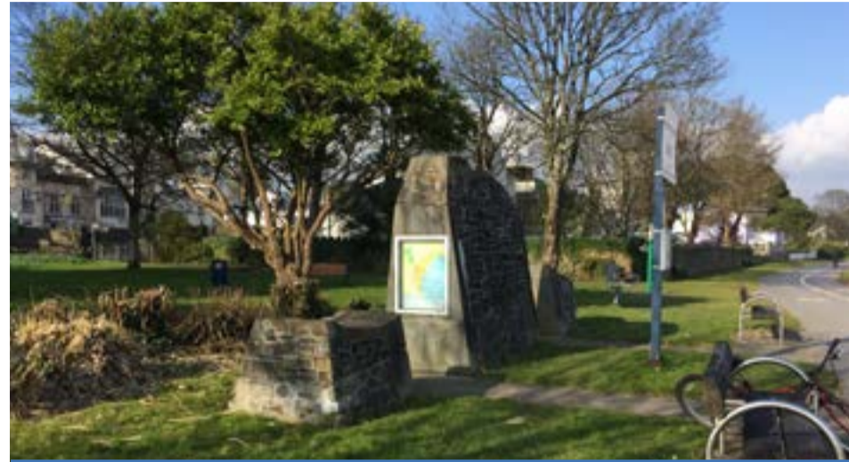
PREPARATORY WORK FOR THE FAMILY AREA AT RIPPLES GREEN

MCC has been working hard to address residents' concerns over litter and dog fouling, parking, road safety and footpaths as well as providing attractive equipment such as benches, picnic tables and gym equipment.