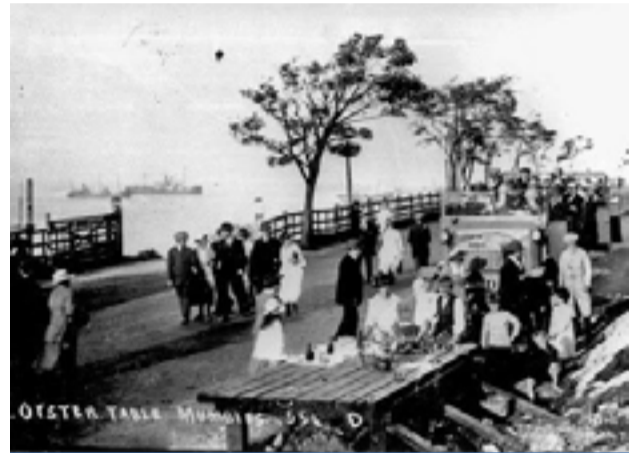
OYSTER TABLE MUMBLES C1900