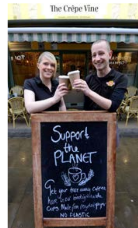
WOULD YOU LIKE TO SEE OUR CAFES AND BARS FOLLOWING SUIT?

Please give us more ideas on how we can spread the message.