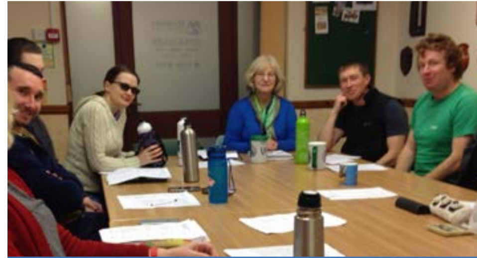
MCC GOES FOR PLASTIC-FREE MEETINGS!