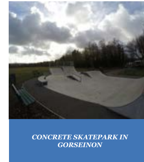
CONCRETE SKATEPARK IN GORSEINON