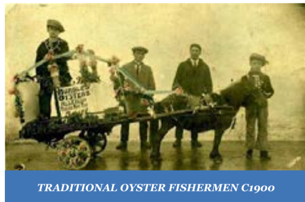
TRADITIONAL OYSTER FISHERMEN C1900