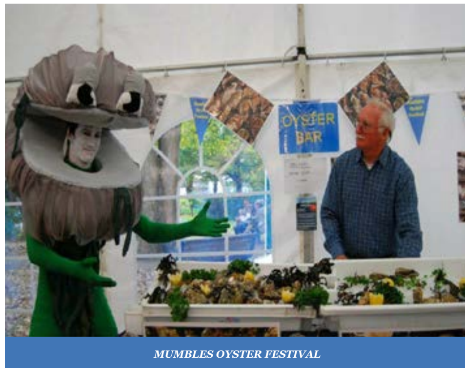
MUMBLES OYSTER FESTIVAL