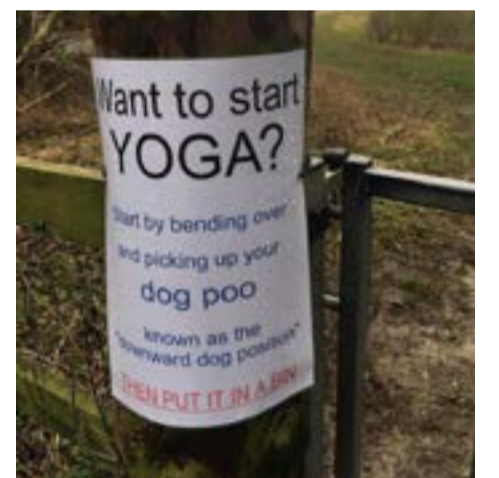
RUBBISH AND DOG POO BAGS ARE SPOILING WALKS. DO WE NEED MORE SIGNS LIKE THESE?