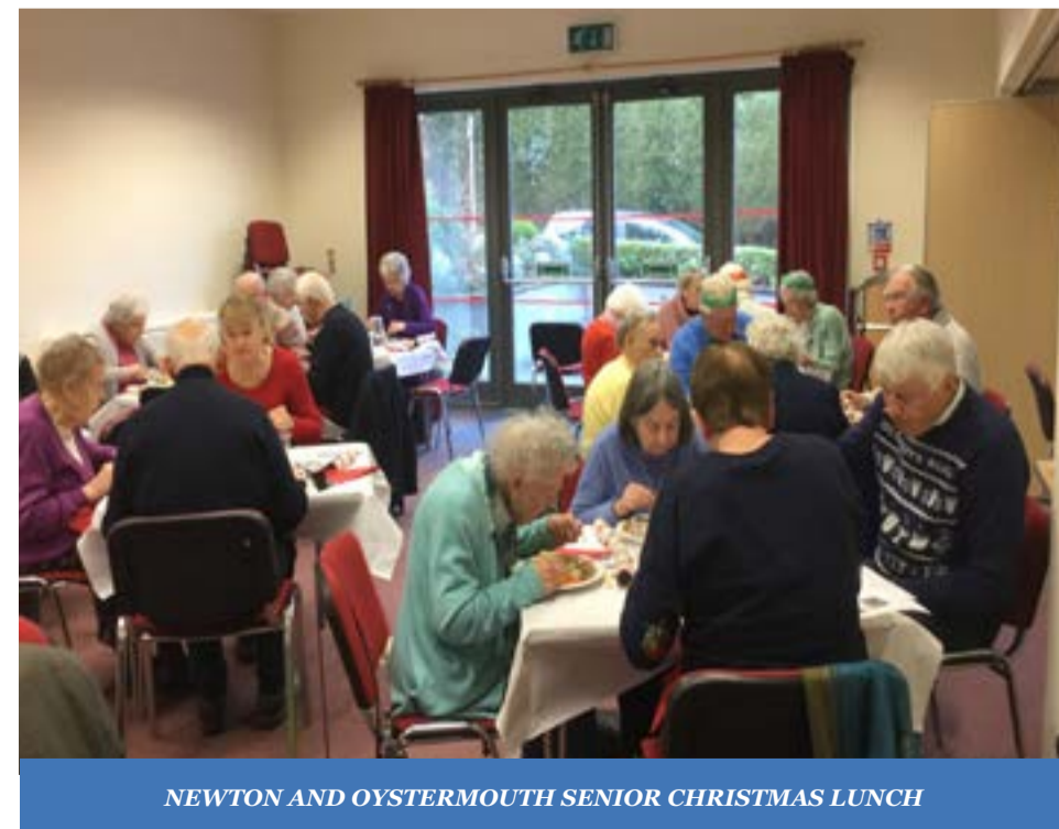
NEWTON AND OYSTERMOUTH SENIOR CHRISTMAS LUNCH