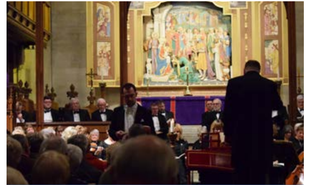
HANDEL'S MESSIAH PERFORMED AT ALL SAINTS CHURCH IN DECEMBER 2017. A GRANT FROM MCC CONTRIBUTED TO THE COST OF THE ORCHESTRA