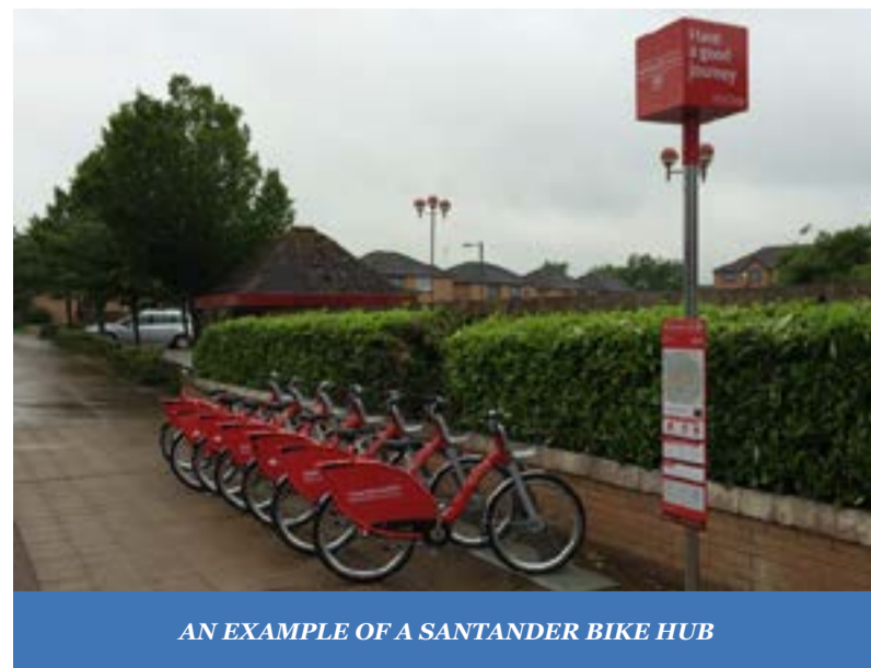
AN EXAMPLE OF A SANTANDER BIKE HUB

Mae llawer iawn o frwdfrydedd yn perthyn i'r Cyngor, a hefyd nifer fawr o syniadau uchelgeisiol. Rydym yn llawn deall bod costau ynghlwm wrth y fath syniadau; fel Cyngor rydym yn llwyr ymrwymo i wariant sydd o fudd hir-dymor i holl drigolion ardal Cyngor Cymuned y Mwmbwls.