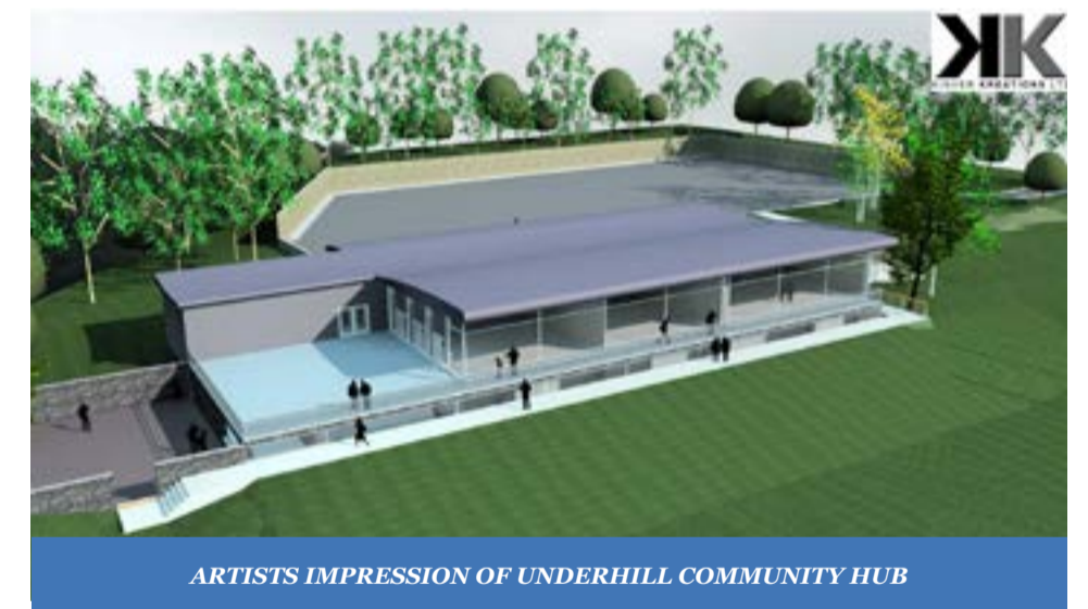
ARTISTS IMPRESSION OF UNDERHILL COMMUNITY HUB