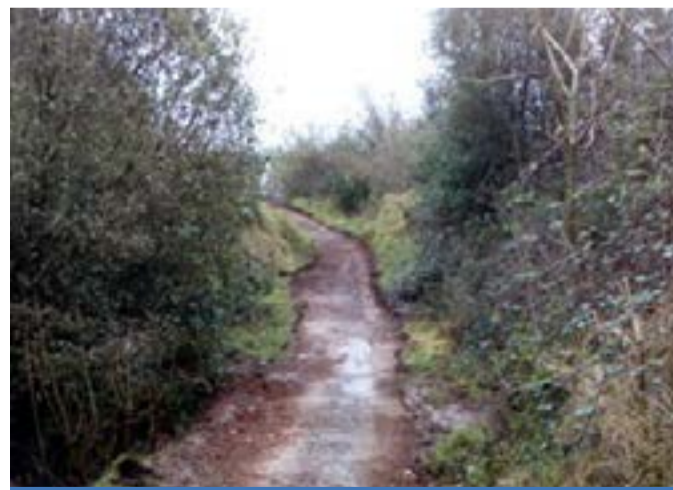
FOOTPATH REPAIR ON MUMBLES HILL