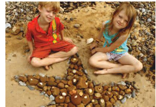
senses to really experience making art. Last year's 2014 event (sponsored by Mumbles Community Council & CCS) is featured on our website.

Mumbles Community Council's grant of £1,000 will be used to fund our Sculpture by the Sea UK Festival project. Firstly, five art workshops will be run by our team of artists in June/July term time for all five of our Mumbles primary schools to create festival flags and displays to use at our annual Sculpture by the Sea UK Festival at Bracelet Bay and Blackpill in July 2015. Artist workshops will then be run at the festival. The festival is a two day event led by trained artists and involves people of all ages taking part in an activity on the beach to create sculptures whilst engaging with the place and nature. We have been running this local festival for ten years so have built up a following of participants each year and the preliminary workshops with the schools ensures that the community is connected with