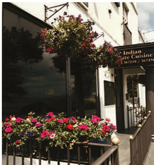
Displays going up all over Mumbles

As you may have noticed, MCC have been spreading out communication wings and taken