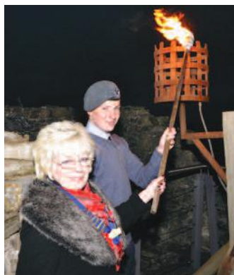
Lighting of the beacon for VE day