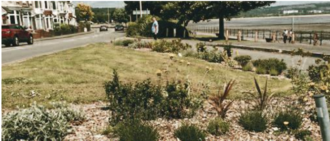
Unightly white posts removed and a floral display takes pride of place.