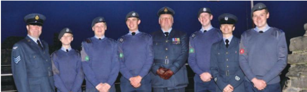
Members of the West Cross ATC Squadron at the lighting of the Beacon Ceremony at Oystermouth Castle, organised by the Mumbles and South Gower Branch of The Royal British Legion, as part of the National Chain of beacons being lit all over the country.