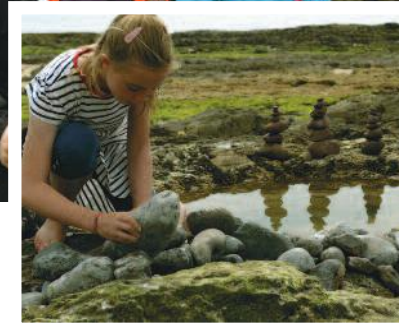
the event through the children who come and take part and in the festival. The festival workshops are both environmental and sustainable as materials used are found - i.e. sand, shells, pebbles etc. and are designed to educate, inspire and delight, touching all the

Mumbles Community Council's grant of £1,000 will be used to fund our Sculpture by the Sea UK Festival project. Firstly, five art workshops will be run by our team of artists in June/July term time for all five of our Mumbles primary schools to create festival flags and displays to use at our annual Sculpture by the Sea UK Festival at Bracelet Bay and Blackpill in July 2015. Artist workshops will then be run at the festival. The festival is a two day event led by trained artists and involves people of all ages taking part in an activity on the beach to create sculptures whilst engaging with the place and nature. We have been running this local festival for ten years so have built up a following of participants each year and the preliminary workshops with the schools ensures that the community is connected with